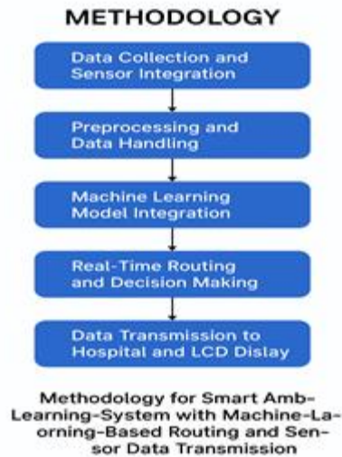
Fig. 1. Methodology for smart ambulance management

This section presents a detailed methodology for the development of a smart ambulance system that integrates machine learning for route optimization, real-time patient vitals monitoring, and energy-efficient operations through Green AI principles.