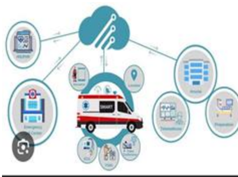
Fig 1: Architecture of a Smart Ambulance System

Emergency Medical Services (EMS) are essential for delivering immediate medical attention during critical situations such as road accidents, cardiac arrests, trauma cases, and natural disasters. The effectiveness of EMS largely depends on the speed and efficiency with which ambulances can reach the patient and transport them to the nearest healthcare facility. However, in most urban and semi-urban regions, traditional ambulance systems are unable to meet these expectations due to a lack of real-time information, intelligent routing, and automated decision-making.