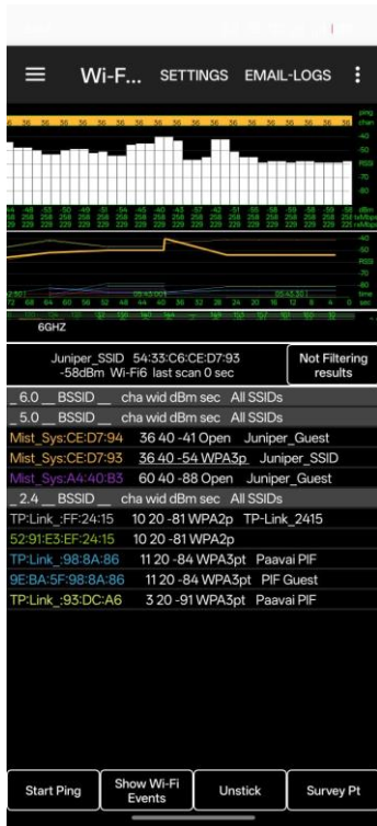
Fig. 3. Client Readings Using Aaruba App.

The analysis of Bit Error Rate (BER) indicates that the relay-assisted system achieves a lower error rate under varying channel conditions. In particular, the Decode-and-Forward (DF) relay protocol demonstrates better performance compared to Amplify-and-Forward (AF), as it eliminates noise during the decoding process before retransmission. Although AF offers lower complexity and faster processing, it amplifies both signal and noise, which affects overall system reliability.