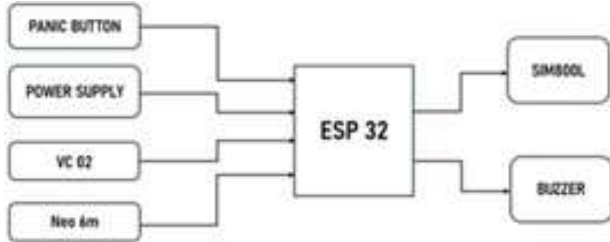
Fig. 1: Block Diagram of System Block Diagram Description:

The system consists of input components such as a panic button, VC-02 voice recognition module, and GPS module, all connected to the ESP32 microcontroller, which acts as the central processing unit. The panic button allows the user to manually trigger the emergency alert, while the VC 02 module enables hands-free activation by detecting predefined keyword "HELP ME." The NEO-6M GPS module continuously provides real-time location data in the form of latitude and longitude, which is essential for tracking the user during emergencies. All these inputs are