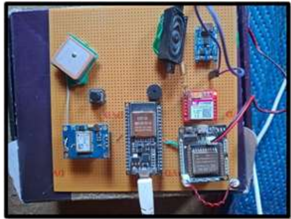
Fig. 3: Hardware Implementation

The system was successfully implemented and tested. The response time for sending SMS alerts was observed to be within a few seconds after activation. GPS module provided accurate location data with an error margin of approximately 2.5 meters under open sky conditions. Voice activation demonstrated reliable performance in controlled environments. Compared to traditional