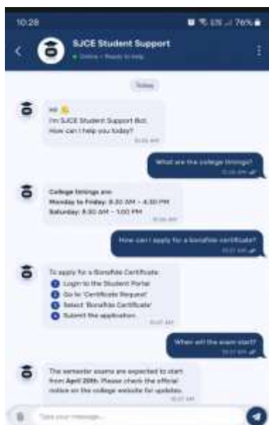
Fig.1. Mobile-Based Chatbot Interface for Student Support System.

This methodical process results in improved query interpretation, promptness in delivering the response, and efficient management of simultaneous user queries.