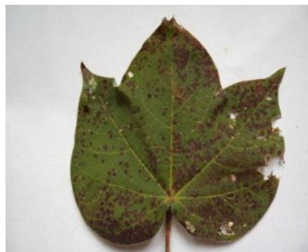
Fig.1: Bacterial Blight leaf spot

Symptoms: In Bacterial blight, leaf spots appear red to brown in colors with angular in shape. The precise appearance is caused by limitation of the sores by fine veins of the cotton leaf. Spots on contaminated leaves may disseminate along the significant leaf veins. As the ailment advances, leaf petioles and stems may end up contaminated, leading to loss of leaves.