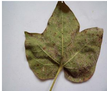
Fig.3 Corynespora Leaf Spot

Symptoms: The parasite normally attacks the older leaves making irregular or angular, pale, translucent spots. They are typically restricted by the vein lets and show up for the most part on the lower surface of the leaf however once in a while on the upper surface. A few to over a hundred spots might be found on a solitary leaf. In extreme conditions the leaves turn yellowish darker and falls off rashly.