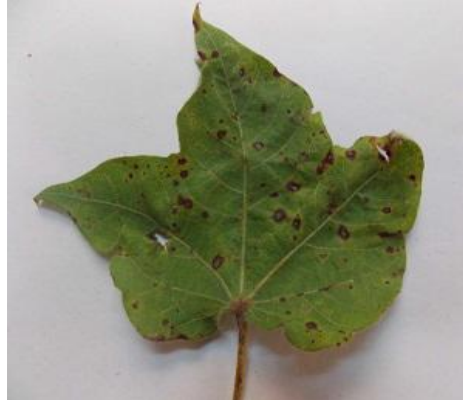
Fig.2: Fungal Leaf Spot

Symptoms: Alternaria leaf spot is a leaf disease but, symptoms may also occur on cotyledons and bolls. Contamination on cotyledons, leaves, and bracts initially shows up as little, circular brown; grey-brown to tan spots which fluctuate in estimate from 1-10 mm. Developed spots have dry, dead, grey centers which regularly break and drop out.