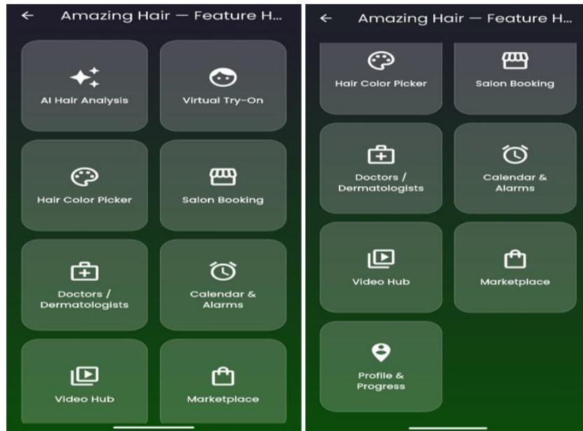
Figure 2: AI-based hairstyle recommendation module with gender/age selection and image upload for face detection