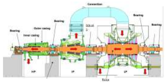
Figure 1: Diagram of 300MW thermal power turbine

The turbine of thermal power plant with a rated capacity of 300MW is a steam turbine. This steam turbine consists of 3 parts: high pressure, intermediate pressure, and low pressure. In particular, the high-pressure turbine is installed on • the same axis as the intermediate pressure turbine to reduce axial force and steam compression, and the low-pressure turbine divides the flow in half to reduce blade height and eliminate axial force (steam flow move to in opposite directions).