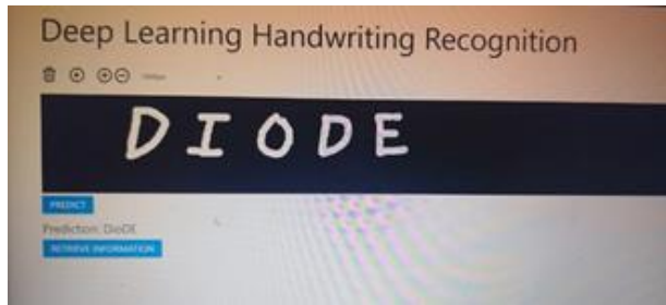
Figure2: Prediction Successful