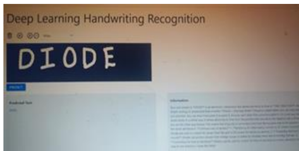
Figure3 Information Retrieval