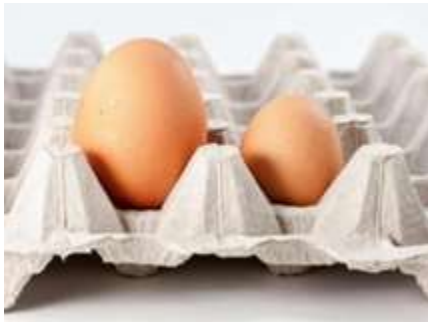
Fig 1.2. Egg sizes

Technological advancements in the last decade have led to the development of automated egg grading and sorting systems using sensors, load cells, optical modules, machine-vision cameras, and conveyor-based handling assemblies. These systems offer more precise classification and minimize direct human contact while improving operational speed, consistency, and food safety (Couturin et al., 2019; Suresh et al., 2021). Recent studies also highlight the integration of data-logging tools, batch tracking, and software-driven analytics, enabling farms to document production trends, optimize flock management, and maintain traceability throughout the supply chain (Park et al., 2022; Zhang et al., 2021). In addition, compact and energy-efficient automation solutions have been promoted for improving grading accuracy without causing excessive financial burden on producers (Han et al., 2020).