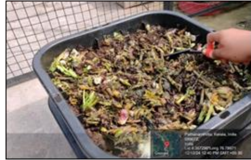
Fig 2.9 Ploughing Compost (partially digested)

The worms reproduce in the worm bin and in no time they will multiply. however, the rate of reproduction is inconsistent and you can't count the worms very easily. At time progresses, we can notice the decreasing level of food scraps and increasing level of compost in bin. We can use vermiwash as a liquid fertilizer in 1:5 ratio i.e for 200 ml of vermiwash and 1 litre water and use for gardening. The vermiwash contains necessary plant nutrients, plant growth promoting hormones (auxin and gibberellins), enzymes (cocktail of protease, amylase urease and phosphates that acts as antimicrobial), symbiotic microbes, nitrogen fixing bacteria such as Azotobacter sp. and Rhizobium and some phosphate solubilising Bacteria) in addition to the macronutrients and micronutrients.