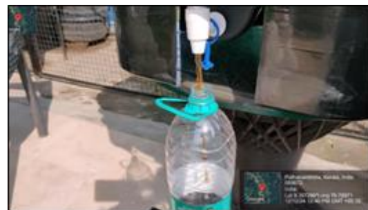
Fig 2.10 (a) Completely digested Compost and (b)collection of vermiwash

If all the food items are converted then it's the harvest time. Vermicompost is the best fertilizer for plants, as it can easily be absorbed. All the organic material has undergone the breakdown process typically done by the worms. Drain water collection tray atleast once in 8-10 days. Before harvesting the compost bin keep under direct sunlight for 5-10 minutes. due to this, worms will migrate towards the bottom of the compost. Slowly scoop out the upper 3-5inch layer of the compost, keep the bottom layer in the tray as it will contain earthworms. We can use the compost as manure now itself, or it can store and use it later. After every 15-18 days we can easily collect 5-6 litres of vermiwash, vermiwash can be diluted to 10 to 25% and can be treated as a pesticide or fertilizer on the crops or on the soil. Finally, the result of project, is the vermiwash and