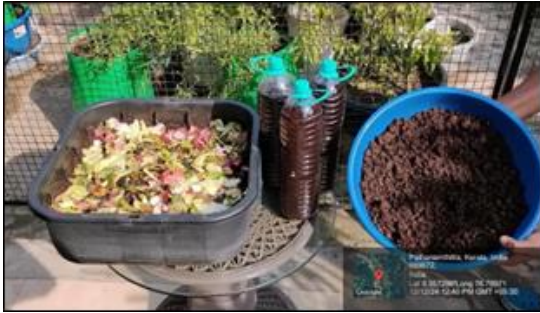
Fig 2.11 Finally Produced Manures (compost and vermiwash)

vermicompost, an organic manure which is formed organically from the kitchen waste.