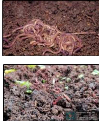
Fig 2.1 Eudrilus eugeniae

Eudrilus eugeniae ; also called the "African nightcrawler", is an earthworm species native to tropical west Africa and now widespread in warm regions under vermicompost; it is an excellent source of protein and has great pharmaceutical potential. Fecundity, growth, maturation and biomass production were all significantly greater at 25 °C than 15°, 20° or 30°. (25 °C = 77 °F). The growth of individual earthworms increases as the population density lowers, but the greatest overall earthworm biomass production occurs at the highest population density. The greatest number of cocoons per week and the number of hatchlings per cocoon are obtained at 25 °C. Cocoons of E. eugeniae hatched in only 12 days at 25 °C, and the worms reach sexual maturity in as little as 35 days after hatching. The African nightcrawler grows well at a temperature of 24–30 °C (75–86 °F). Maximum weight of around 2.5 grams occurs within 8–10 weeks.