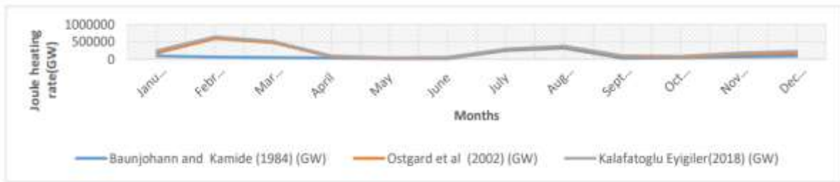
Fig. 2. Graph of Joule heating energy rate for the year 2011