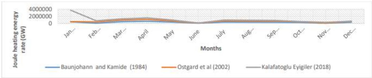
Fig 1. Graph of Joule heating energy rate for the year 2010