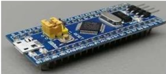
Figure 3 STM32

The hardware implementation of the proposed system is developed using an STM32 microcontroller as the main control unit. All peripheral components are interfaced with the controller to enable real time current monitoring, fault detection, line isolation and remote fault reporting. The complete hardware setup is designed to ensure reliable operation under normal and fault conditions.