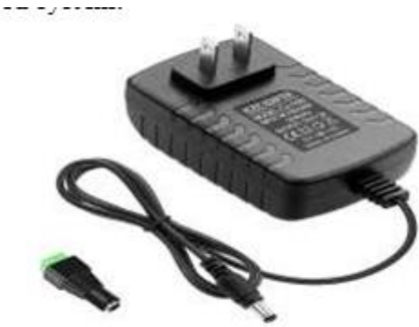
Figure 7 5V Power Supply