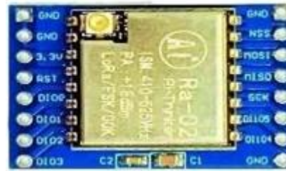
Figure 6 LoRa SX1278

For remote fault reporting, a LoRa SX1278 module is interfaced with the STM32 for wireless transmission of fault information. The transmitted data is received by a LoRa receiver unit at the monitoring side and displayed on a display or alert unit, enabling the lineman to quickly identify the fault location and take corrective action.