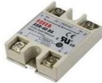
Figure 5 solid state relay

Upon detection of a fault, the STM32 generates a control signal to activate the solid state relay. The SSR is connected between the power line and the load to isolate the faulty section immediately, thereby protecting the system from further damage and improving operational safety.