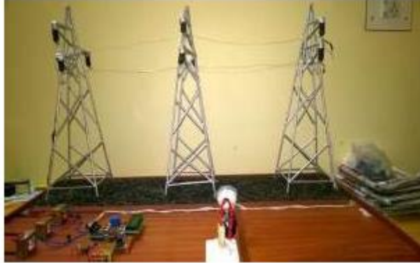
Figure 9: Hardware Implementation

tables in accordance with IEEE formatting guidelines. The block diagram, flow chart, and hardware implementation diagrams are prepared with clear labeling, uniform font size and adequate resolution to ensure readability.