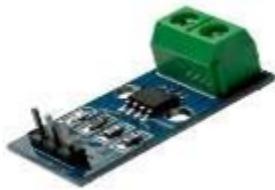
Figure 4 ACS712 sensor SSR -40DA

The ACS712 current sensor is connected in series with the distribution line to continuously sense the line current. The analog output of the sensor is interfaced with the ADC pin of the STM32 microcontroller. The controller continuously monitors the sensed current and compares it with a predefined threshold value of 5 A to detect short circuit faults.