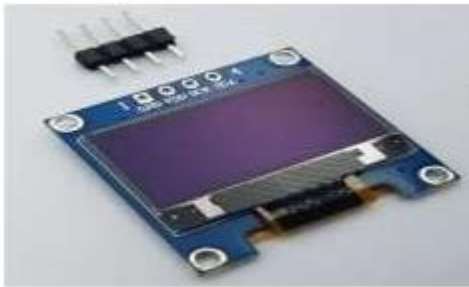
Figure 8 LED Display

The display unit provides clear visual information about the operating status and fault condition of the distribution line. An LCD display interfaced with the receiver side controller shows real-time system status during normal operation and displays fault details such as current magnitude and fault location or pole identification when a short circuit occurs. By presenting fault information locally, the display unit enables quick understanding by maintenance personnel, reduces response time and improves the reliability and efficiency of the power distribution system.