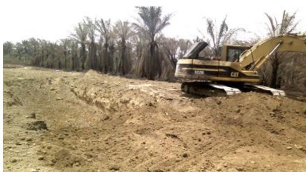
Figure 4. Bulking and backfilling operations at Obele-Ibaa (2016). Mechanical soil mixing enhances aeration and distribution of biostimulation amendments across Tier II priority zones. For the Tier I P3 hotspot, subsurface excavation to below 30 cm and ex-situ thermal or bioaugmentation treatment is recommended as a necessary supplement to surface landfarming. Photograph taken during the 2016 site investigation.