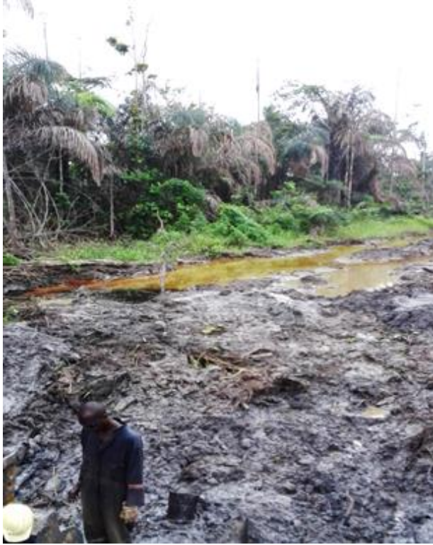
Figure 2. Crude oil-contaminated site at Obele-Ibaa, Emohua LGA, Rivers State, Nigeria. The uniform extent of surface oil contamination visible in the photograph is consistent with the low coefficient of variation (CV = 17.3%) documented in topsoil THC across the three sampling positions, while the photograph also shows locally deeper oil penetration in lower-lying areas consistent with the subsurface heterogeneity captured in the VDR analysis. Photograph taken approximately 12 months post-spill during the 2016 site investigation.

Note. n/r = not reported in source. CV estimates are derived from published concentration ranges where S.D. was not explicitly stated. All THC in mg/kg unless stated.