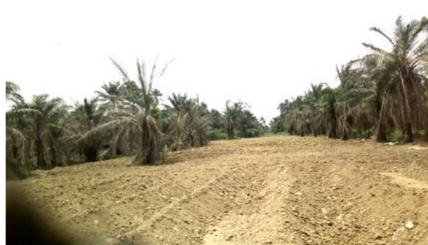
Figure 3. Windrow standing operations at the Obele-Ibaa RENA remediation site (2016). The spatial prioritization framework (Table 5) designates P1 and P2 positions (and P3 topsoil) as Tier II High priority zones for intensified windrow aeration combined with biostimulation. The P3 subsoil hotspot (Tier I Critical) requires targeted excavation in preference to surface landfarming alone. Photograph taken during the 2016 site investigation.

The sample size of three positions per depth provides sufficient data for CV, VDR, and DAC computation but is inadequate for formal geostatistical analysis (variogram modelling, kriging). A minimum of 20–30 positions on a systematic grid would be required for reliable spatial interpolation of the contamination field. Future studies should additionally: (i) employ GC-FID or GC-MS to achieve compound-specific THC fractionation and PAH profiling rather than total-extractable UV spectrophotometry; (ii) collect samples below 30 cm depth to determine whether the P3 hotspot plume has reached the water table; (iii) install temporary piezometers and collect groundwater samples for dissolved-phase hydrocarbon analysis; and (iv) measure soil texture and hydraulic conductivity at each position to enable quantitative modelling of the relationship between soil physical properties and THC spatial variability. Such incorporation of these measurements into a coupled NAPL migration model would significantly enhance the predictive and prescriptive value of pre-remediation spatial assessments at Niger Delta spill sites.