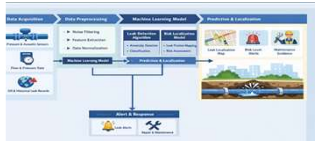
Fig.2. Methodology workflow of the Early Leak Prediction and Risk Localization in Urban Water Pipelines

The final module provides a user interface that displays real-time pipeline conditions, predicted leak risks, and system alerts. When abnormal conditions are detected, the system automatically generates notifications for maintenance authorities. This module helps decision-makers quickly identify problem areas and take preventive actions to reduce water loss and infrastructure damage.