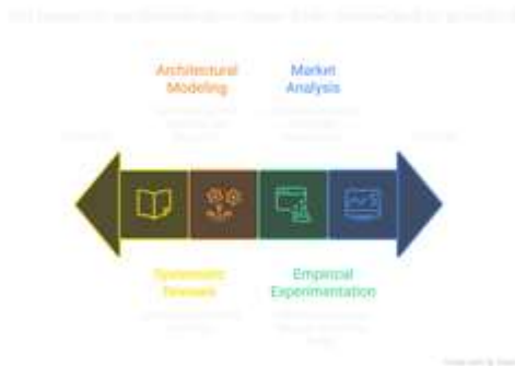
Fig. 2. Introduction of the four main types of methodologies utilized for analyzing the efficiency and possibility of deploying 5G network technology.

Seven papers (papers 1, 2, 3, 7, 9, 11, 15) use systematic review and/or survey methodologies. Kamal et al. (2021) use PRISMA for resource allocation frameworks identification and classification, thus providing for replication and reducing selection bias [15]. The use of surveys is well justified in fast-growing areas such as 5G