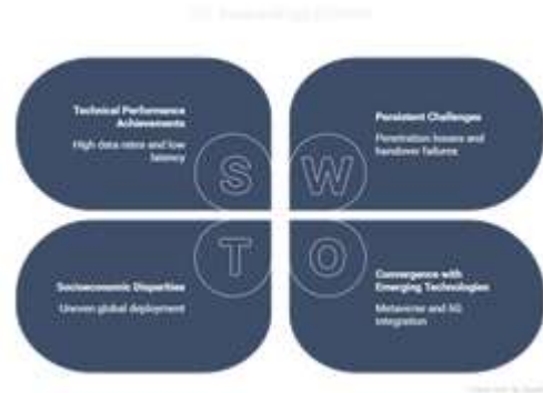
Fig. 4. Enter Caption