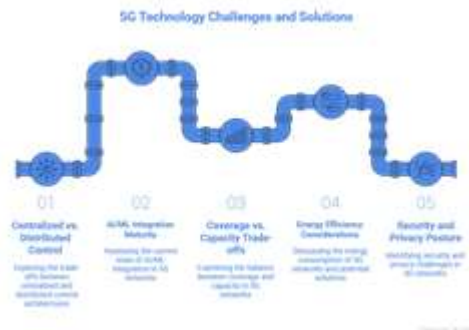
Fig. 3. Exploring the world of 5G: From architectural design considerations and AI/ML readiness to energy efficiency and security concerns prove that slice improvements can be achieved even without