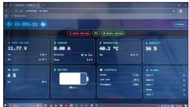
Fig. 3: Simulation Image