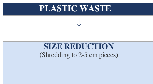
Fig. 2 - Pyrolysis Process Flow Chart (Methodology)