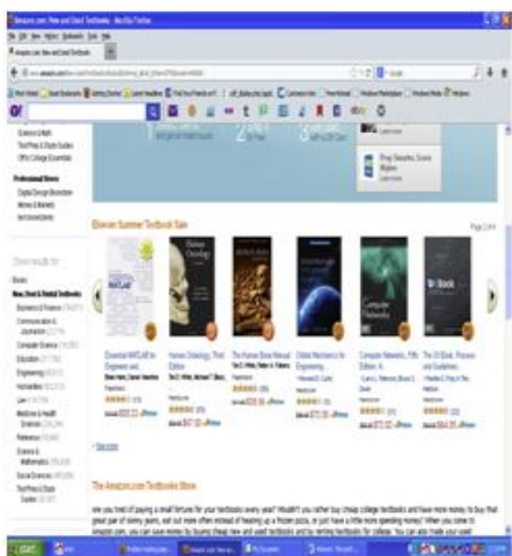
Fig 4. Amazon book recommender interface. Sourced from.

A percentage of the experimental investigations led byZiegler et al. [24] uncovered that correspondence exists between trust Also user similitude The point when community's trust organize may be certain should A percentage particular provision. Emulating those studies, it could be deduced that computational trust models camwood go about as fitting intends to supplement or totally trade current community oriented filtering method [73]. Diverse