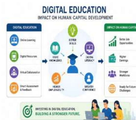
Fig - Impact on human capital development

Digital education has the potential to significantly impact human capital development by: