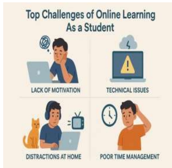
Fig - Challenges of digital education

Despite its numerous benefits, digital education also presents several challenges and limitations: