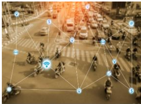
Fig. 1: Wireless Sensor Networks

Also, WSNs are self-organizing. If one node fails, others continue the work. The system adjusts automatically.