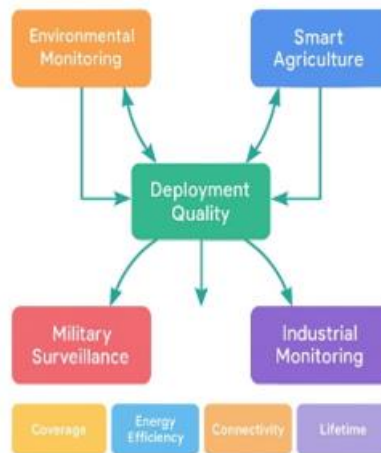
Fig. 4 : Deployment Quality

From this study, energy efficiency is the biggest issue. Many techniques exist, but none is perfect. Range-based methods are accurate but costly. Simpler methods save money but reduce performance. Artificial Intelligence improves decision-making but increases complexity. In my opinion, combining simple and intelligent methods can give better results.