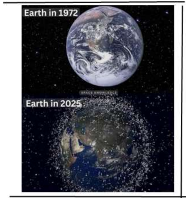
Fig.5.1 Increasing space debris.

Therefore, effective mitigation strategies and coordinated global efforts are essential to ensure the long-term sustainability of space activities.